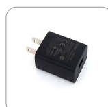
Power Adapter (USB)