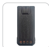
Li-polymer Battery 4000mAh